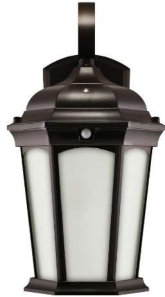
Integrated LED Fixture

*Note: Design, features and specifications subject to change without notice. Some features may not be available on all models. For more information please visit: www.eurilighting.com or call 1-888-743-5766