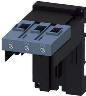
stand-alone assembly support for 3RU21/3RB30/3RB31 Size S3 Main circuit: screw terminal