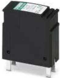
Protective plug PT with HF protective circuit for 4 signal wires. Nominal voltage: 5 V DC

Please be informed that the data shown in this PDF Document is generated from our Online Catalog. Please find the complete data in the user's documentation. Our General Terms of Use for Downloads are valid ( http://download.phoenixcontact.com )