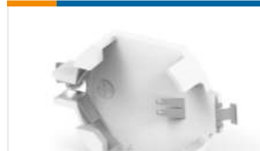
TE Part #796136-2 ASSY, SMT BATTERY CONN