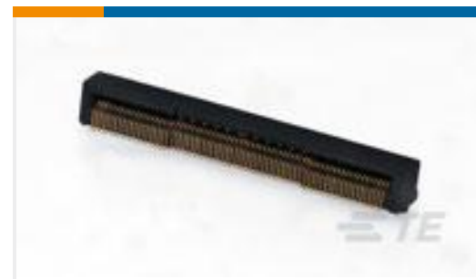
TE Part #2057630-1 CFP Receptacle Conn Assy