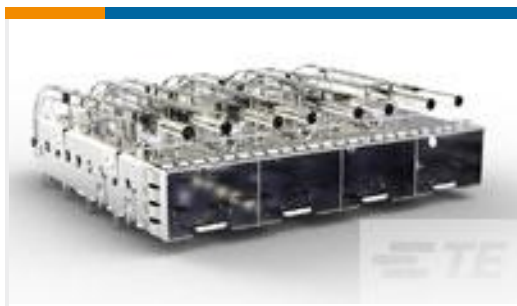
TE Part #2170030-1 SFP+ 1x4 w/ Ultra Low Profile LP