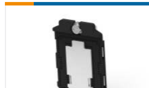
TE Part #2041549-1 SOCKET ASSY, DMD 350, T/R, G/F