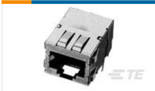
TE Part #1734509-4 RJ45, 8P8C, W/LED, G/Y, 50u"