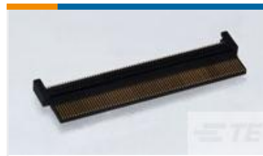
TE Part #2057629-1 CFP Module Conn Assy