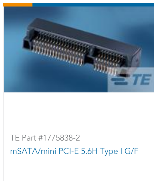
TE Part #1775838-2 mSATA/mini PCI-E 5.6H Type I G/F