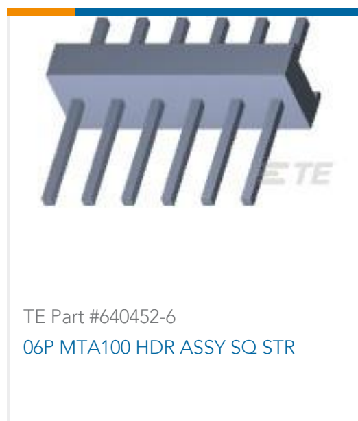
TE Part #640452-6 06P MTA100 HDR ASSY SQ STR