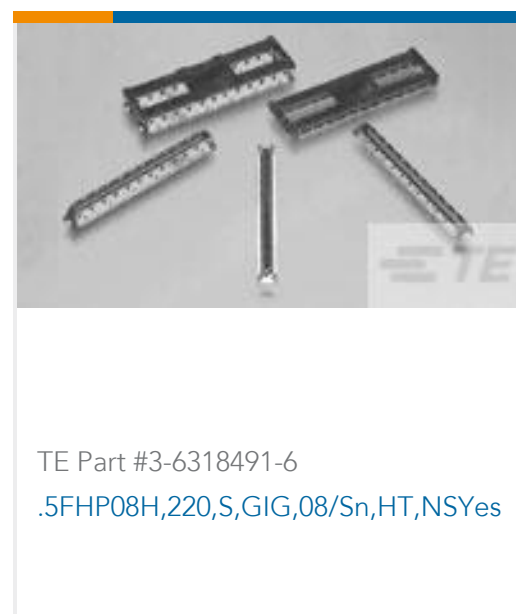
TE Part #3-6318491-6 .5FHP08H,220,S,GIG,08/Sn,HT,NSYes