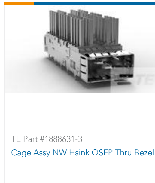
TE Part #1888631-3 Cage Assy NW Hsink QSFP Thru Bezel