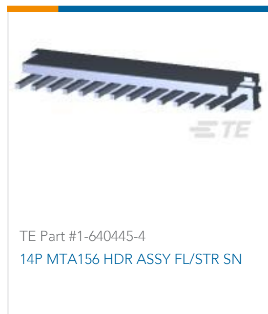
TE Part #1-640445-4 14P MTA156 HDR ASSY FL/STR SN