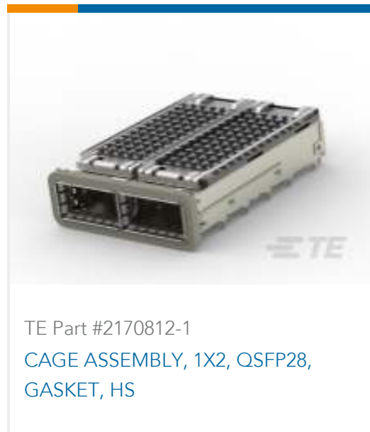
TE Part #2170812-1 CAGE ASSEMBLY, 1X2, QSFP28, GASKET, HS