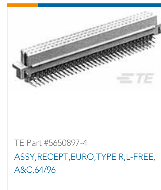
TE Part #5650897-4 ASSY,RECEPT,EURO,TYPE R,L-FREE, A&C,64/96