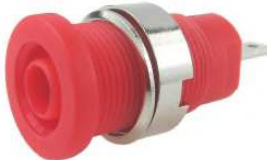
FCR73575R S16N/4.8 RED WNW