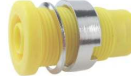
FCR7357Y S16N YELLOW WNW SOLDER TAG VERSION

Shrouded, 4mm, nickel or tin plated socket. Mates with shrouded or unshrouded plugs. Rated 1000V, CAT III. 24A for 4.8mm FastOn and Solder tag 32A for 6.3mm FastOn