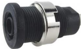
FCR7357B S16N BLACK WNW SOLDER TAG VERSION