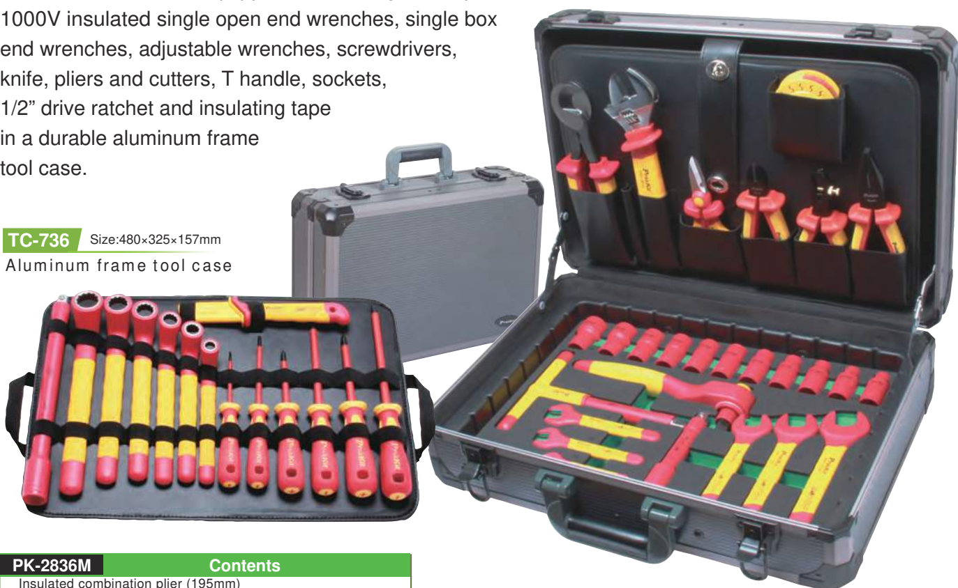
TC-736 Size:480×325×157mm Aluminum frame tool case

PK-2836M tool kit equipped with a range of 41pcs 1000V insulated single open end wrenches, single box end wrenches, adjustable wrenches, screwdrivers, knife, pliers and cutters, T handle, sockets, 1/2" drive ratchet and insulating tape in a durable aluminum frame tool case.