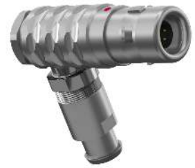
POSITIONS: 8 positions