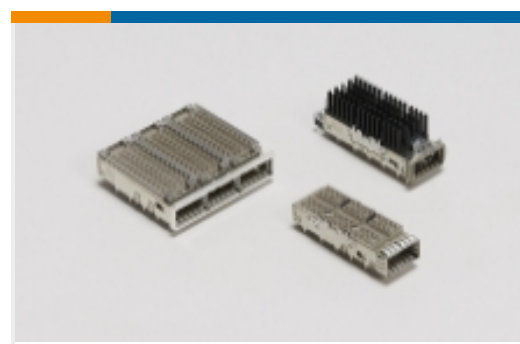
QSFP, QSFP+ &amp; zQSFP+(432)