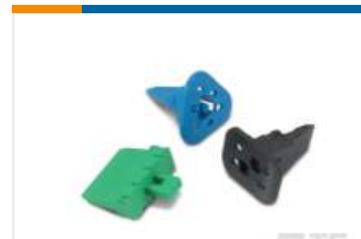
TE Part #W2P Wedge locks: DEUTSCH DT