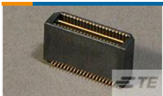
TE Part # 1658046-1 MSB0.80PL11ASY040FL,-,F,-TY