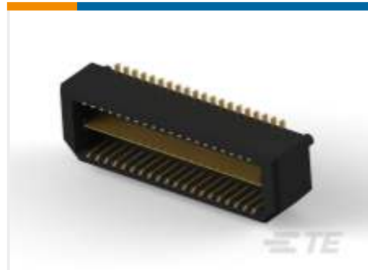
TE Part # 6-1658013-1 MSB0.80PL5ASY040FL,GP,10,-TR