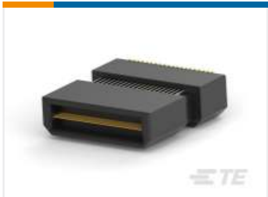
TE Part # 1658018-1 MSB0.80PL22ASY040FL,-,10,-TY