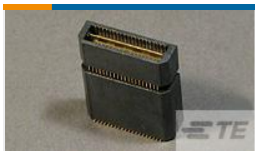
TE Part # 1658050-1 MSB0.80PL25ASY040FL,-,F,-TY