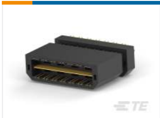
TE Part # 1658016-1 MSB0.80PL16ASY040FL,-,10,-TY