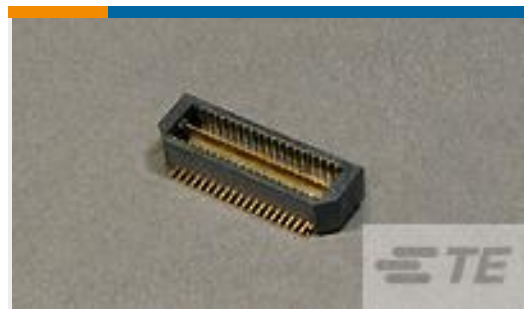
TE Part # 1658044-1 MSB0.80PL5ASY040FL,-,F,-TY