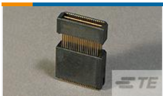
TE Part # 1658051-1 MSB0.80PL30ASY040FL,-,F,-TY