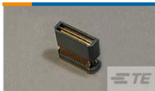
TE Part # 1658048-1 MSB0.80PL19ASY040FL,-,F,-TY