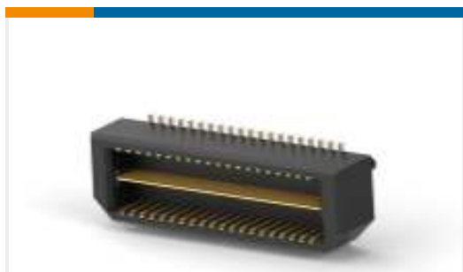
TE Part # 1658013-1 MSB0.80PL5ASY040FL,-,10,-TY