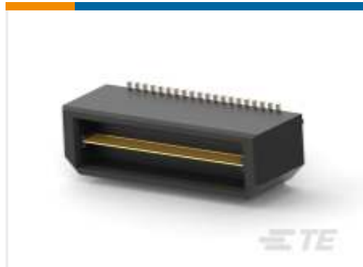
TE Part # 1658014-1 MSB0.80PL8ASY040FL,-,10,-TY