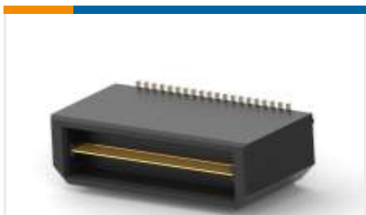
TE Part # 1658015-1 MSB0.80PL11ASY040FL,-,10,-TY