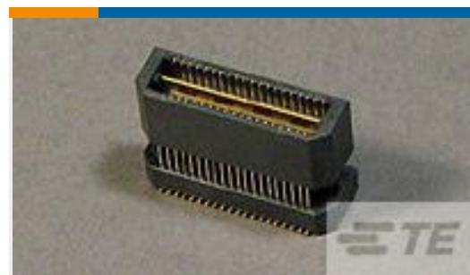
TE Part # 1658437-1 MSB0.80PL14ASY040FL,-,F,-TY