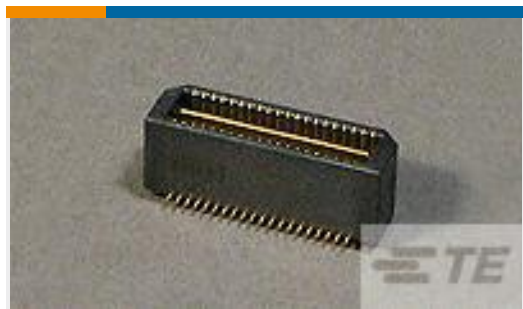
TE Part # 1658045-1 MSB0.80PL8ASY040FL,-,F,-TY