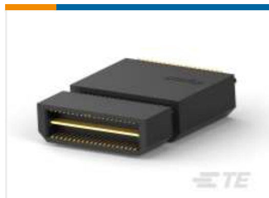
TE Part # 1658019-1 MSB0.80PL25ASY040FL,-,10,-TY