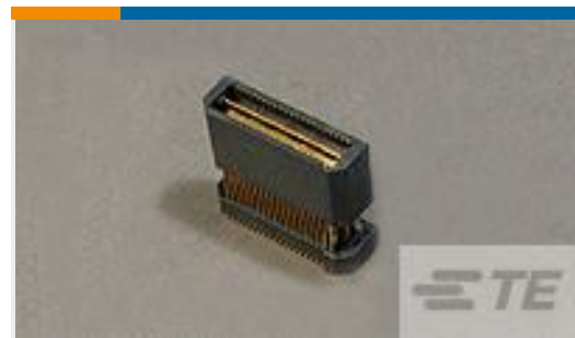
TE Part # 1658017-1 MSB0.80PL19ASY040FL,-,10,-TY