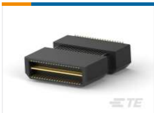
TE Part # 1658049-1 MSB0.80PL22ASY040FL,-,F,-TY