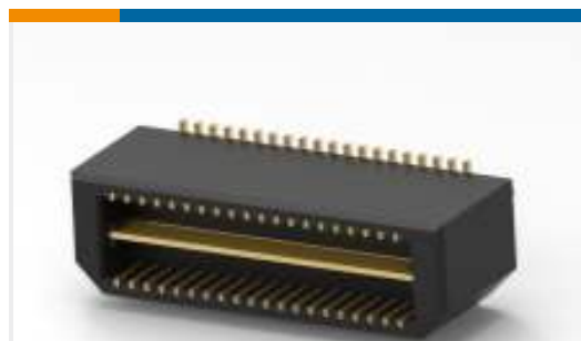
TE Part # 6-1658014-1 MSB0.80PL8ASY040FL,GP,10,-TR