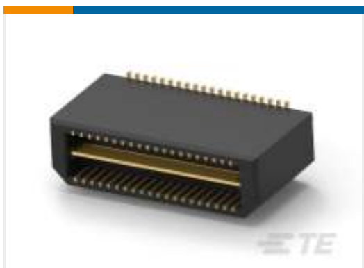
TE Part # 6-1658015-1 MSB0.80PL11ASY040FL,GP,10,-TR