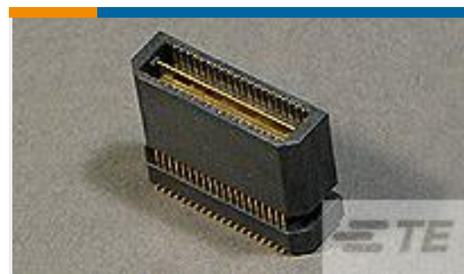
TE Part # 1658047-1 MSB0.80PL16ASY040FL,-,F,-TY