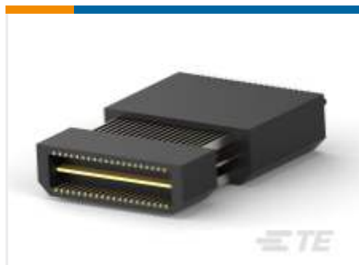
TE Part # 1658020-1 MSB0.80PL30ASY040FL,-,10,-TY