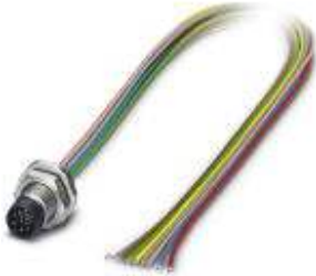
Sensor/actuator flush-type plug, 8-pos., M8, rear/screw mounting with M8 fastening thread, with 0.5 m TPE litz wire, 8 x 0.14 mm 2

Please be informed that the data shown in this PDF Document is generated from our Online Catalog. Please find the complete data in the user's documentation. Our General Terms of Use for Downloads are valid ( http://download.phoenixcontact.com )