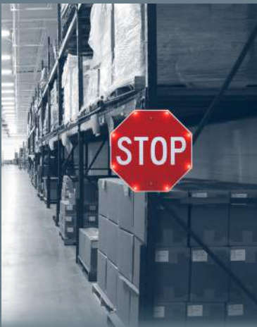
WAREHOUSE RACK MOUNT