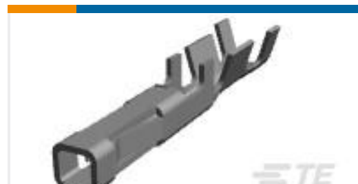
TE Part #1-794610-2 MICRO MNL RPT CNT,LS PC 30AU L