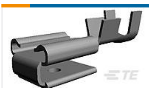
TE Part #62274-1 250 FASTON REC 22-18 AWG TPBR