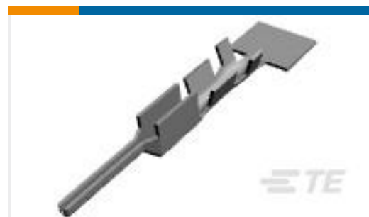
TE Part #1-794608-0 PIN CONT 20-24 TIN PLATE STRIP