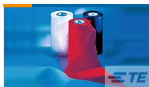
TE Part #C95590-000 1330-3300-101TT