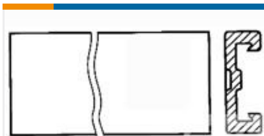
TE Part #640642-8 08P MTA100 COVER F/T