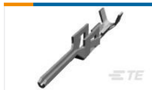
TE Part #1-794613-0 PIN CONT 26-30 TIN PLATE L/P