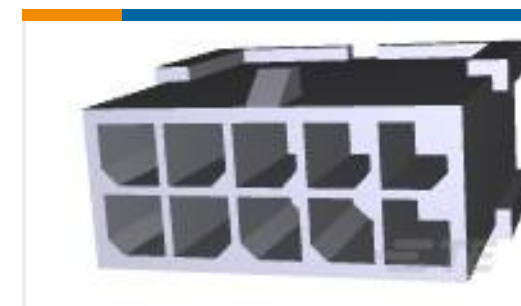
TE Part #1-794616-0 FREE HANG DBL ROW HSG 10 POS