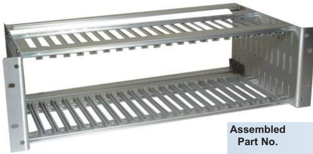
CCA13S/90 - Assembled Subrack with 21 pairs on Snap-in Guides