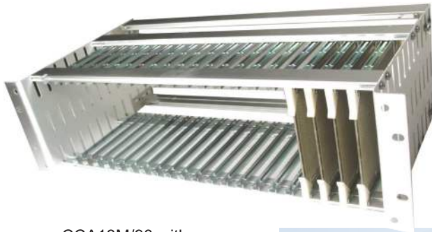
CCA13M/90 with Screw-in guides