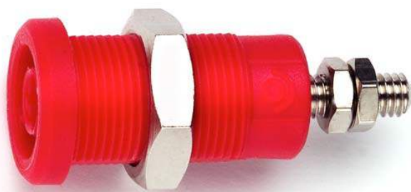
Model 72930 Panel Mount IEC 61010 4mm (0.16in) Jack for Sheathed Plugs