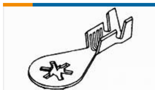
TE Part #63482-1 RING 18-14 AWG TPSTL