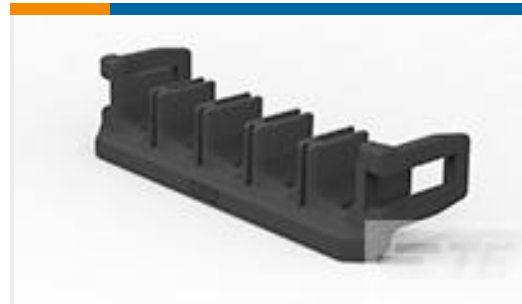
TE Part #1971777-5 PTL TPA HIGH TEMP 1 x 5 BLACK