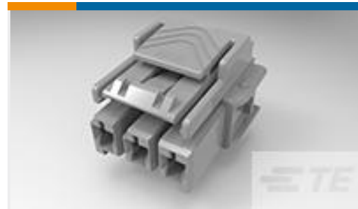
TE Part #5-1971773-3 PTL 1X3 PLUG HSG HIGH TEMP KEY A LGR