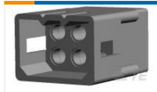
TE Part #770090-1 06P .093 COMM P&S PLUG HSG