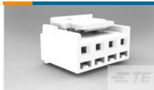
TE Part #2132781-5 05P EP-II HOUSING, NATURAL