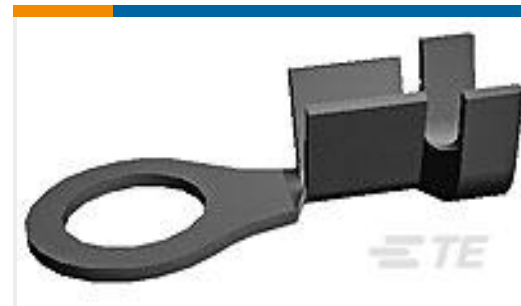
TE Part #40661 RING 190(4.82 MM) TERMINAL 18-14 AWG BR