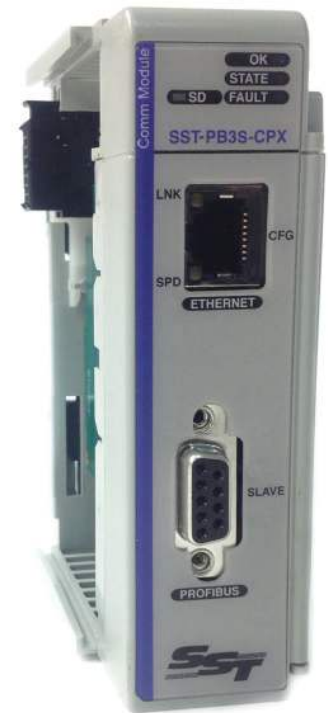
SST™-PB3S-CPX PROFIBUS* Slave Module