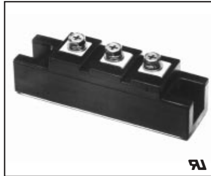
CD410830 Dual Diode POW-R-BLOK™ Modules 30 Amperes/800 Volts