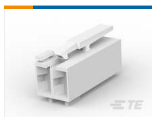
TE Part # 6-1241961-2 STD TIM HOUSING MKII 2POS