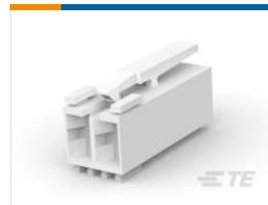
TE Part # 969484-1 STD TIM MK2 GEH 2P