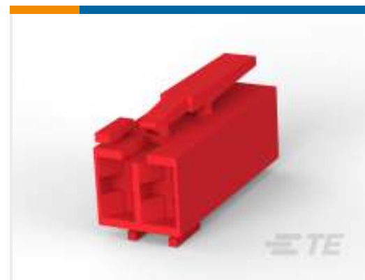
TE Part # 6-1241983-2 STANDARD TIMER HOUSING MARK II