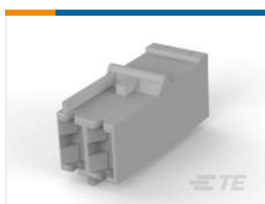
TE Part # 964768-2 STD-TIM HSG SPECIAL 2P (GREY)