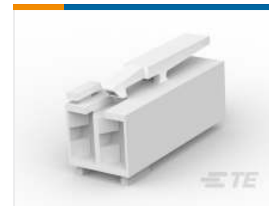
TE Part # 8-1241961-2 STD TIM HOUSING MKII 2POS