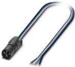
Assembled contact carrier and insulating body, T-coding, 4-pos., 0.5 m long litz wires

Please be informed that the data shown in this PDF Document is generated from our Online Catalog. Please find the complete data in the user's documentation. Our General Terms of Use for Downloads are valid ( http://download.phoenixcontact.com )