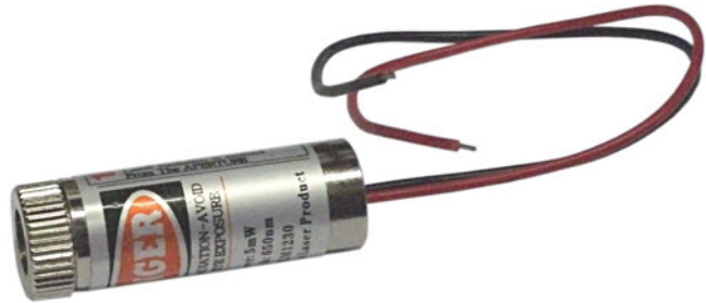
< 5mW 650nm FOCUSABLE LASER MODULE