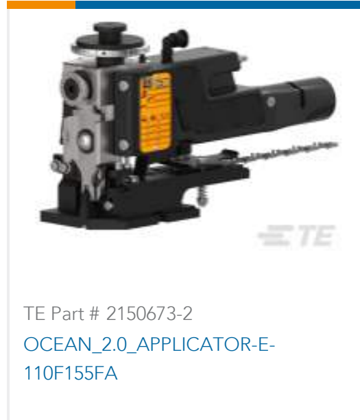
TE Part # 2150673-2 OCEAN_2.0_APPLICATOR-E- 110F155FA