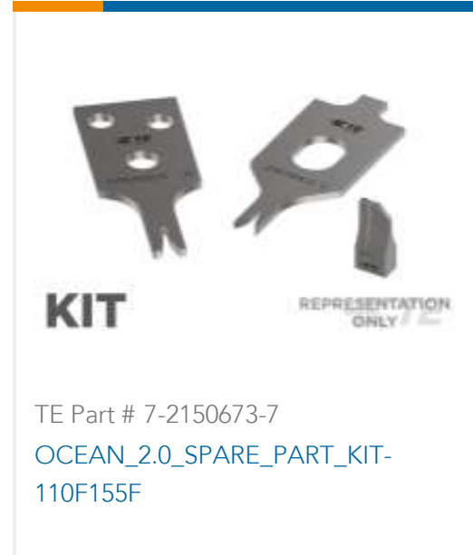
TE Part # 7-2150673-7 OCEAN_2.0_SPARE_PART_KIT- 110F155F