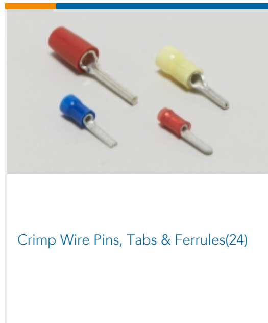
Crimp Wire Pins, Tabs & Ferrules(24)