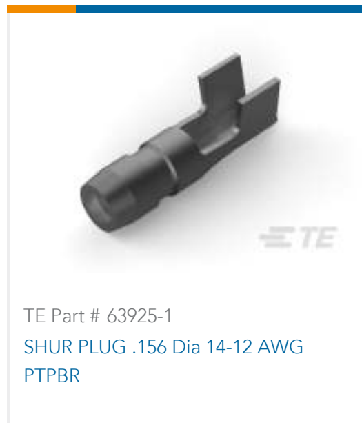
TE Part # 63925-1 SHUR PLUG .156 Dia 14-12 AWG PTPBR