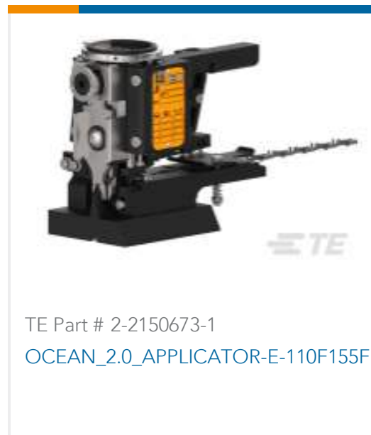
TE Part # 2-2150673-1 OCEAN_2.0_APPLICATOR-E-110F155F