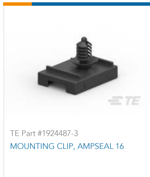
TE Part #1924487-3 MOUNTING CLIP, AMPSEAL 16