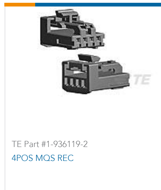
TE Part #1-936119-2 4POS MOS REC