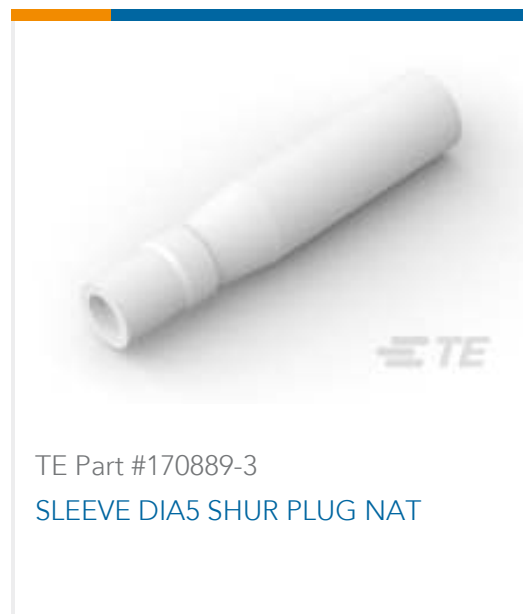
TE Part #170889-3 SLEEVE DIA5 SHUR PLUG NAT