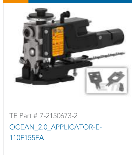
TE Part # 7-2150673-2 OCEAN_2.0_APPLICATOR-E- 110F155FA