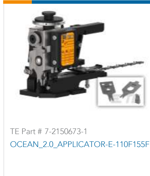
TE Part # 7-2150673-1 OCEAN_2.0_APPLICATOR-E-110F155F