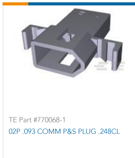
TE Part #770068-1 02P .093 COMM P&S PLUG .248CL