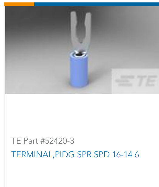
TE Part #52420-3 TERMINAL,PIDG SPR SPD 16-14 6