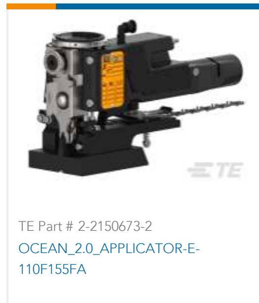
TE Part # 2-2150673-2 OCEAN_2.0_APPLICATOR-E- 110F155FA