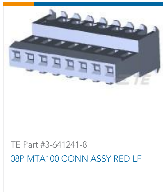
TE Part #3-641241-8 08P MTA100 CONN ASSY RED LF