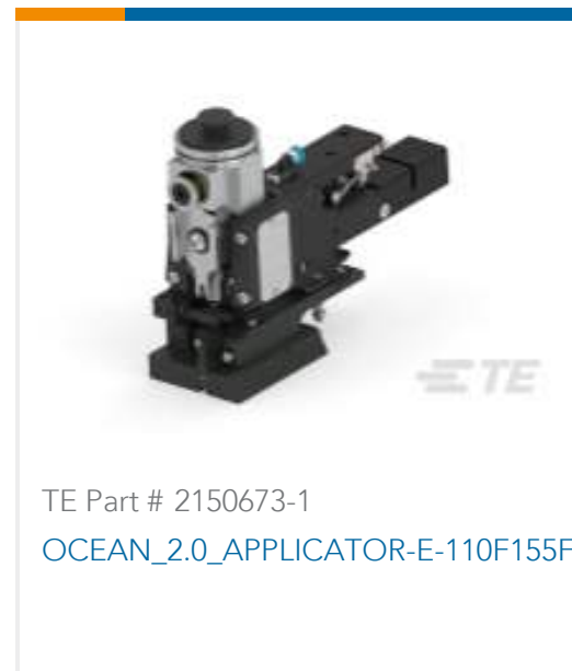
TE Part # 2150673-1 OCEAN_2.0_APPLICATOR-E-110F155F