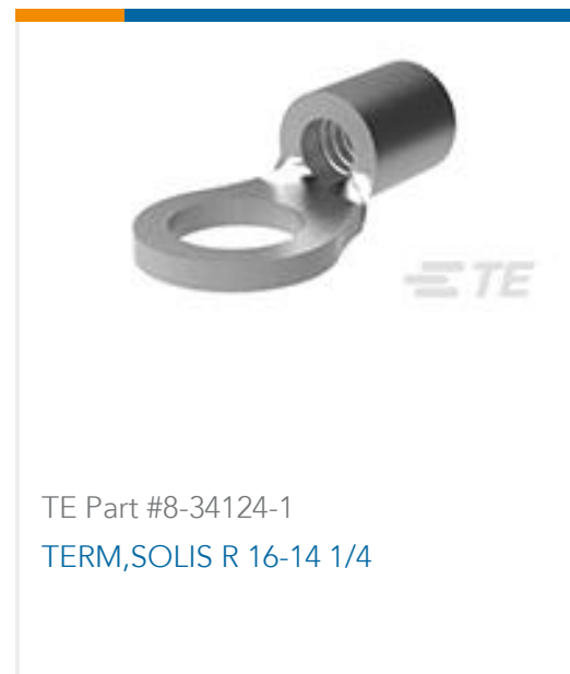
TE Part #8-34124-1 TERM,SOLIS R 16-14 1/4