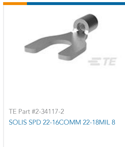
TE Part #2-34117-2 SOLIS SPD 22-16COMM 22-18MIL 8