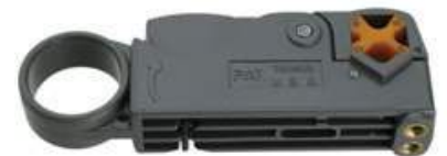
GST-1 Coaxial Wire Stripper Tool