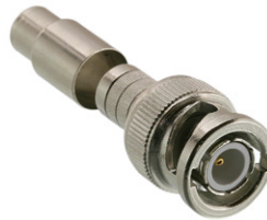
301-4TP BNC Male 2 Pc Crimp- On, 50 Ohm