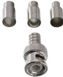
301-00TP Universal BNC Male 2 Pc Crimp-On, 50 Ohm