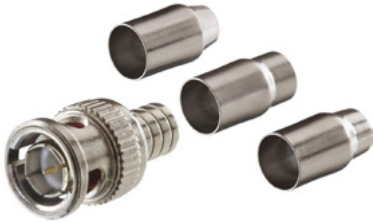
301-00-75TP Universal BNC Male 2 Pc Crimp-On, 75 Ohm