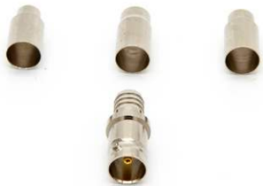
350-00-75TP Universal BNC Female 2 Pc Crimp-On, 75 Ohm