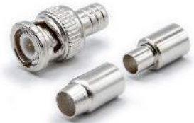
301-0TP BNC Male 2 Pc Crimp-On, 50 Ohm