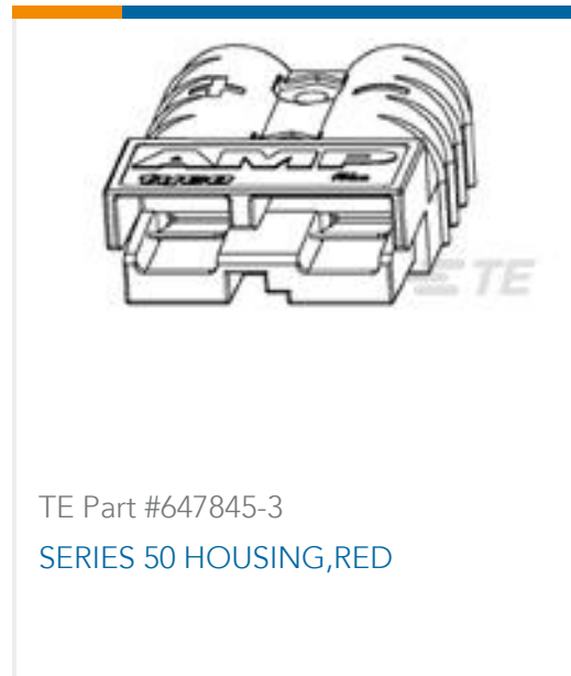
TE Part #647845-3 SERIES 50 HOUSING,RED