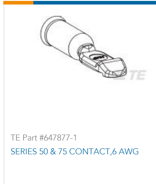
TE Part #647877-1 SERIES 50 & 75 CONTACT,6 AWG