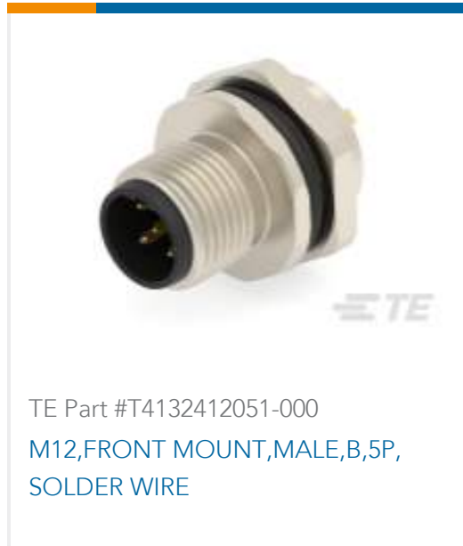
TE Part #T4132412051-000 M12,FRONT MOUNT,MALE,B,5P, SOLDER WIRE