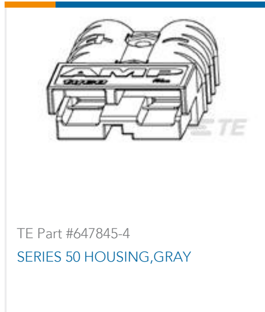
TE Part #647845-4 SERIES 50 HOUSING,GRAY