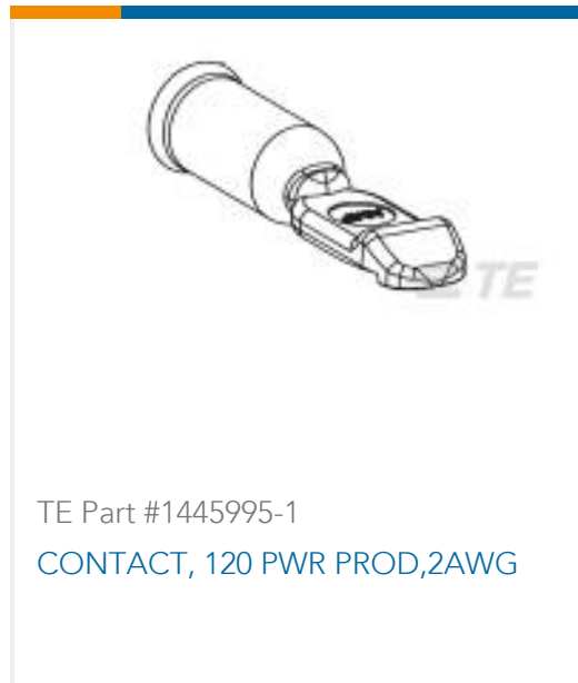
TE Part #1445995-1 CONTACT, 120 PWR PROD,2AWG