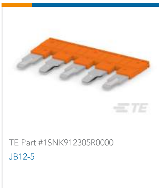
TE Part #1SNK912305R0000 JB12-5