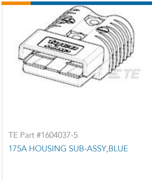
TE Part #1604037-5 175A HOUSING SUB-ASSY,BLUE