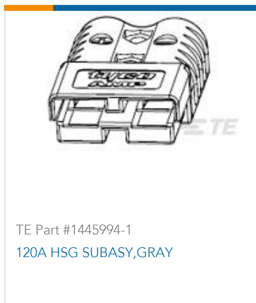
TE Part #1445994-1 120A HSG SUBASY,GRAY