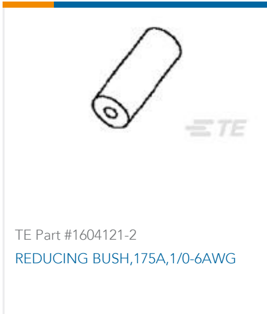
TE Part #1604121-2 REDUCING BUSH,175A,1/0-6AWG