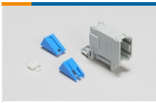
Rectangular Connector Adapters(4)