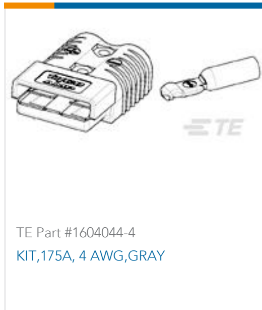
TE Part #1604044-4 KIT,175A, 4 AWG,GRAY