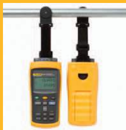
TPAK Magnetic Hanger