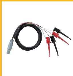
Universal RTD Adapter