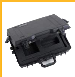
Probe and Readout Case