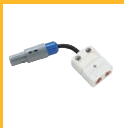
Universal Thermocouple Adapter