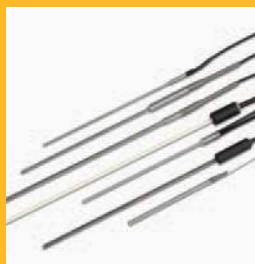
Calibrated Temperature Sensors

A wide array of accessories is available to help you maximize productivity, but the following are essential for most users.