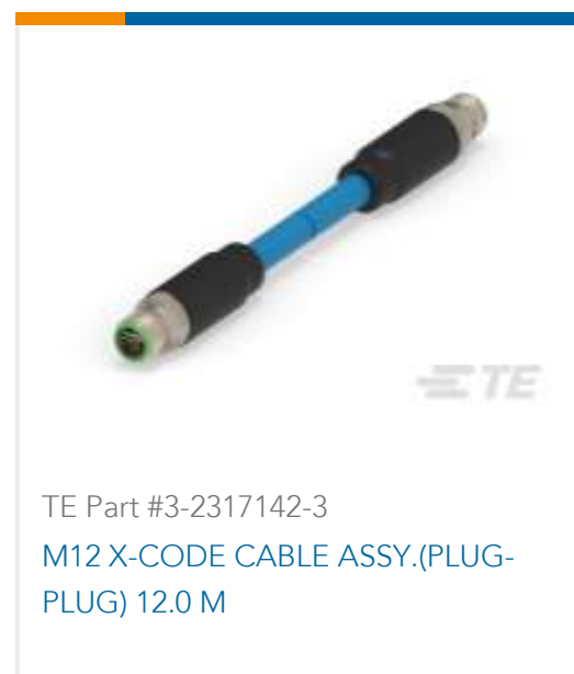
TE Part #3-2317142-3 M12 X-CODE CABLE ASSY. (PLUG- PLUG) 12.0 M