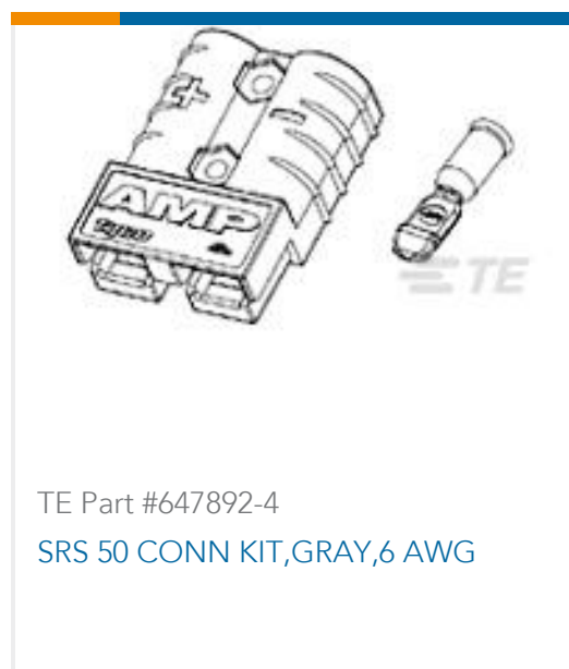
TE Part #647892-4 SRS 50 CONN KIT, GRAY, 6 AWG