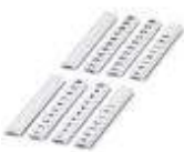
Zack Marker strip, flat, can be ordered: Strip, white, labeled according to customer specifications, Mounting type: Snap into flat marker groove, for terminal block width: 5 mm, Lettering field: 5.15 x 5.15 mm

Zack Marker strip, flat - ZBF 5 CUS - 0825025