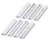
Zack Marker strip, flat, Strip, white, labeled, Printed horizontally: Consecutive numbers 1 - 10, 11 - 20, etc. up to 491 - 500, Mounting type: Snap into flat marker groove, for terminal block width: 5 mm, Lettering field: 5.15 x 5.15 mm

Zack Marker strip, flat - ZBF 5,LGS:FORTL.ZAHLEN - 0808671