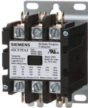
Contactor, 42DP,40A,3P,Open,24V Contactor, 42DP,40A,3P,Open,24V