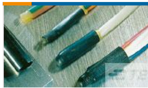
TE Part #EG41060001 ES-CAP-NO.2-B9-0-50MM