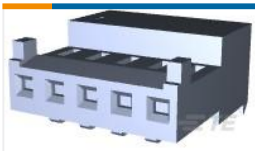
TE Part #3-644043-5 05P MTA100 CONN ASSY LF