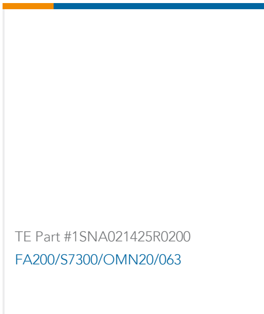
TE Part #1SNA021425R0200 FA200/S7300/OMN20/063