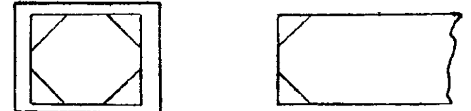
④ TIP DETAIL D

⑤ 1. RECOMMENDED HOLE SIZE IN P.C. BOARD FOR PLUG "C" END .125^{+.004}_{-.002}