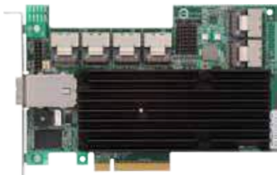
3ware® SAS 9750-24i4e

Unprecedented power in multi-stream RAID environments delivers high-performance and reliable data protection.