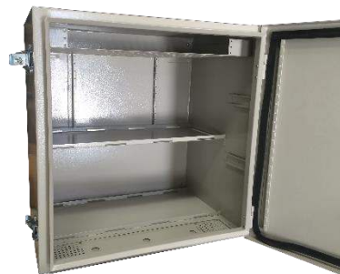
RPSTL Enclosure interior without batteries or controller