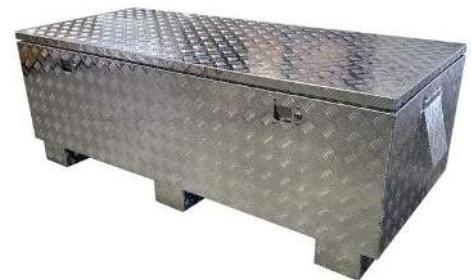
RPAL Diamond Plate Aluminum Ground Mount