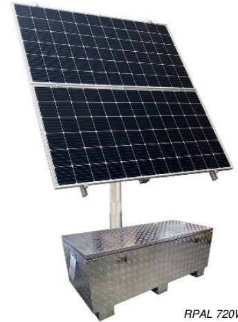
RPAL 720W Solar System