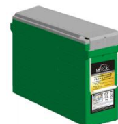
AGM 12V 180Ah Battery