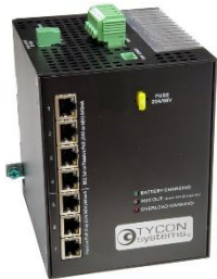
TPDIN-SC48-20 MPPT Controller with manageable 7 Port Gigabit PoE Switch