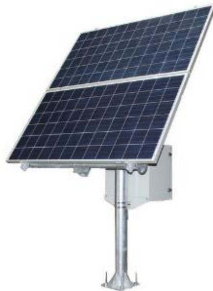
RPSTL 720W 2 Panel Solar System