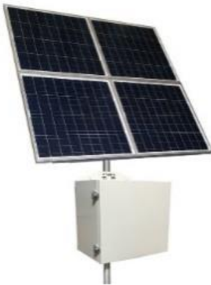
RPSTL 340W 4 Panel Solar System