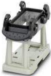
HEAVYCON connector assembly frame with panel mounting base with double locking latch, for contact inserts of type B24, 150 mm long

Please be informed that the data shown in this PDF Document is generated from our Online Catalog. Please find the complete data in the user's documentation. Our General Terms of Use for Downloads are valid ( http://download.phoenixcontact.com )