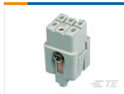
TE Part #T2080052201-000 HQ-005-F