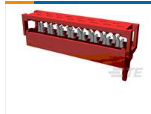
TE Part #215083-6 MICRO-MATCH MOW.06P