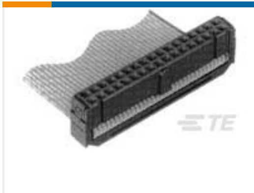
TE Part #1658622-5 24 NOVO MIL/CTR 30DP, LEAD FREE