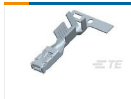
TE Part #1719838-1 MCON 2.8 TERMINAL - LL