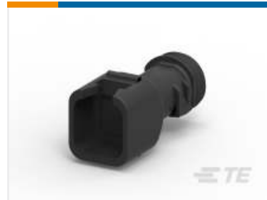
TE Part #1011-239-0605 BKSHL, 6P, BLK, PLG, ST, NW8.5/10/13