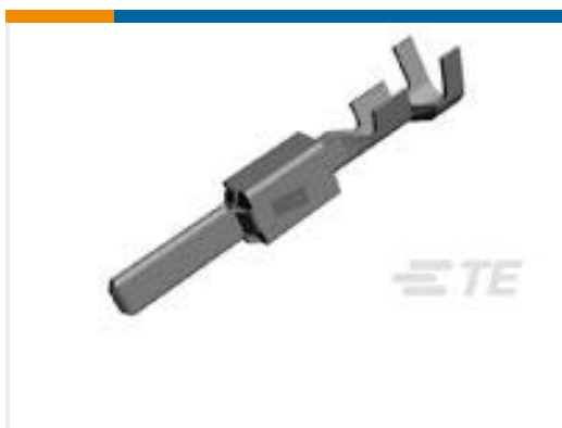
TE Part #1-962916-1 TAB 2.8x0.8 CONTACT CS SWS Sn