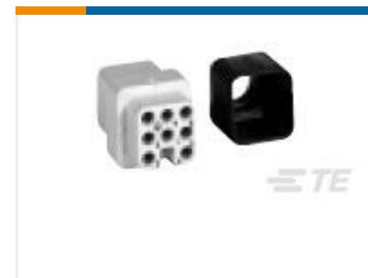
TE Part #2-1103101-3 HN.D.7.BU.C. 250 V