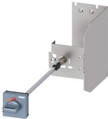
Door-coupling rotary operating mechanism for harsh conditions For circuit breaker Size S3 Handle gray