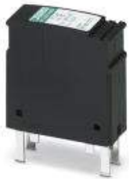
PLUGTRAB, plug-in surge protection for Foundation Fieldbus

Please be informed that the data shown in this PDF Document is generated from our Online Catalog. Please find the complete data in the user's documentation. Our General Terms of Use for Downloads are valid ( http://phoenixcontact.com/download )