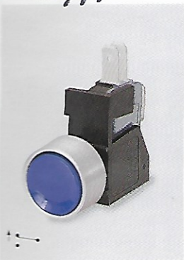
383 2510 K BL