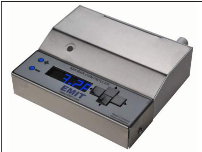
Figure 1. EMIT Pulsed Ion Bar Controller