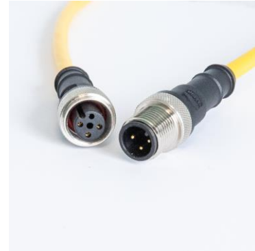
Male and Female 3-pole