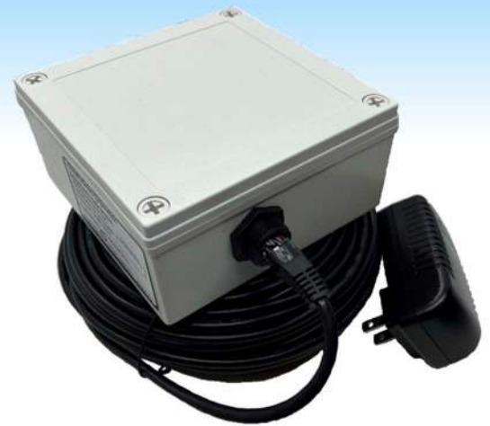
OPS8243 Traffic Monitor