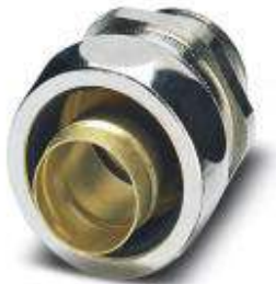
Cable gland made from brass with metric thread, IP65 protection

Please be informed that the data shown in this PDF Document is generated from our Online Catalog. Please find the complete data in the user's documentation. Our General Terms of Use for Downloads are valid ( http://phoenixcontact.com/download )