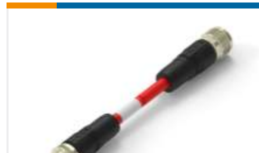
TE Part #TAA545B1411-060 M12A4-MS-FS-PVC-6.0M