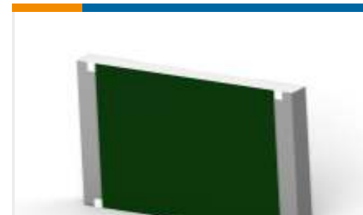
TE Part #8-2176407-8 3560 27R 5%