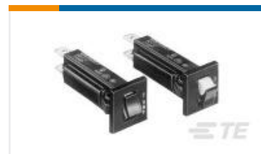
TE Part #1-1393250-7 W28-XQAT-15=W28