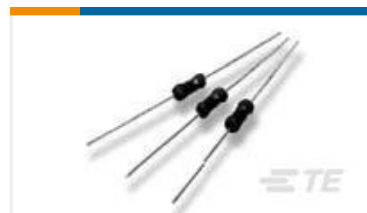
TE Part #4-1879350-2 RR01 5% 11R AMMO