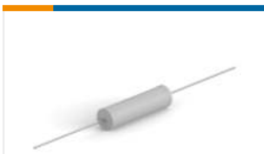
TE Part #4-2176414-8 7W STD M/OX 5% 1K8