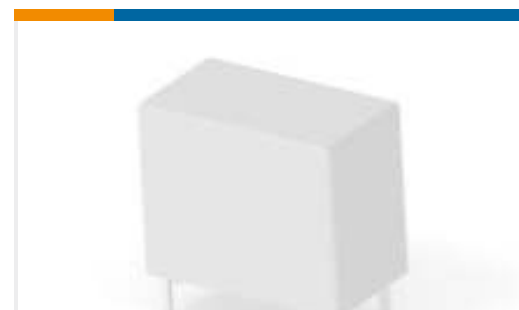
TE Part #1721083-7 OJ-SS-112LMHF,000T0