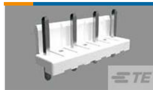
TE Part #1-1123724-2 3.96EP HDR ASSY 2(3)P NATURAL