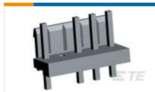
TE Part #1-1717011-4 EP CONN.HDR ASSY 4/5POS SPECIA