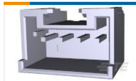
TE Part #917782-1 2.5 S.D.L POST HDR ASY 4P STD