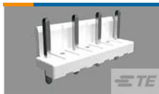
TE Part #1-1123724-4 3.96EP HDR ASSY 4(7)P NATURAL