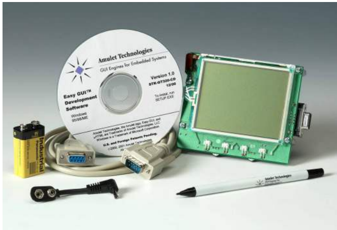
STK-GT320 — Starter Kit with 3.8" LED backlit display and 9V battery STK-GT570 — Starter Kit with 5.7" CCFL backlit display and AC power adapter