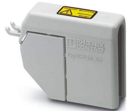
Illustration shows the product version UHV 25-AH

http://eshop.phoenixcontact.de/phoenix/treeViewClick.do?UID=2130460