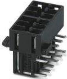
HSC header, touch-proof, 2 units, 12 connections, color: black

Please be informed that the data shown in this PDF Document is generated from our Online Catalog. Please find the complete data in the user's documentation. Our General Terms of Use for Downloads are valid ( http://phoenixcontact.com/download )