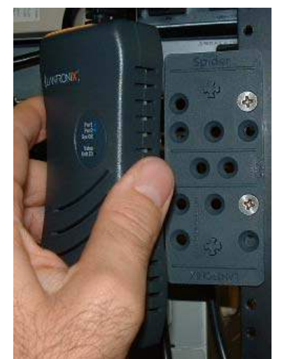
2. Attach the Spider to the bracket's mounting posts