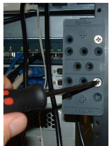
1. Mount the bracket with a Phillips-head screwdriver

There are 3 easy steps to install the mounting bracket and Spider into a server rack: