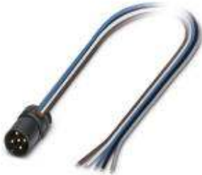
Assembled contact carrier and insulating body with 0.5 m litz wires and crimp contacts

Please be informed that the data shown in this PDF Document is generated from our Online Catalog. Please find the complete data in the user's documentation. Our General Terms of Use for Downloads are valid ( http://download.phoenixcontact.com )