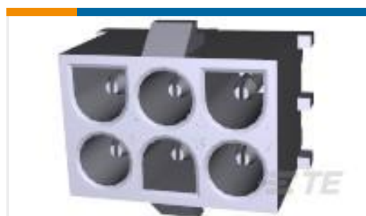
TE Part #350732-4 06P UMNL PIN HDR ASSY 94VO LF