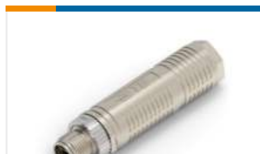
TE Part #2327989-1 M12 X-CODE CAT6A