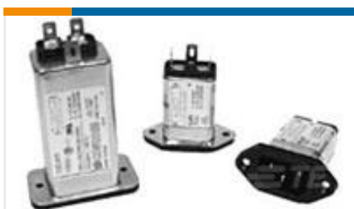
TE Part #6609008-3 6EJH1=F8043 S0