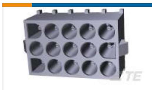
TE Part #350738-4 15P UMNL PIN HDR ASSY 94VO LF