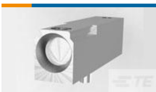
TE Part # 5223957-3 UPM GUIDE MODULE