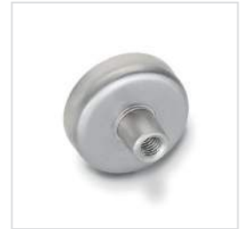
View of magnetic surface